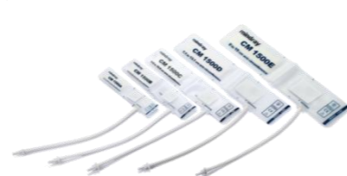
NIBP: Variety of cuffs fit multiple patient sizes