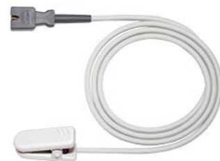
SpO 2 : Interchangeable clips can be read on a variety of sites