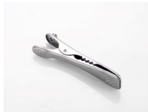
ECG: Non-traumatic alligator clips